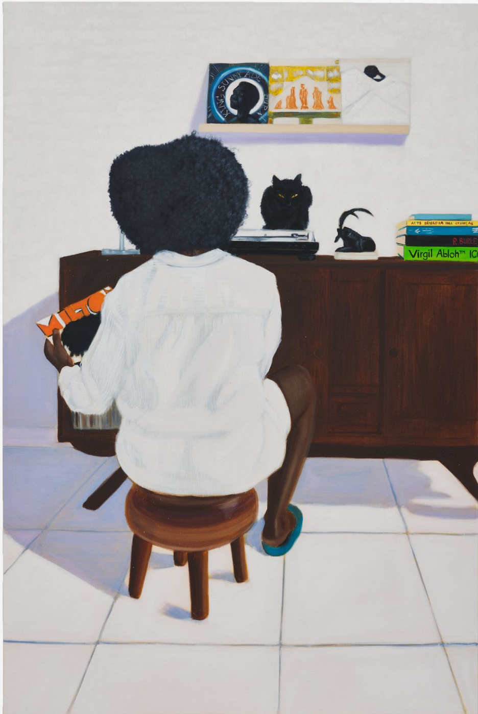
Thot não é Hermes, 2023 Oil on canvas 150 x 100 cm | 59 x 39.3 in