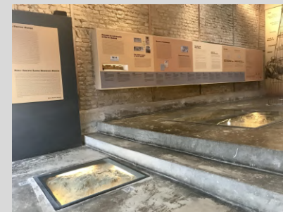
Permanent exhibition at the Pretos Novos Memorial Museum, where the Pretos Novos Cemetery Archaeological Site, the central element of the debate about the memory of the slavery in Brazil.